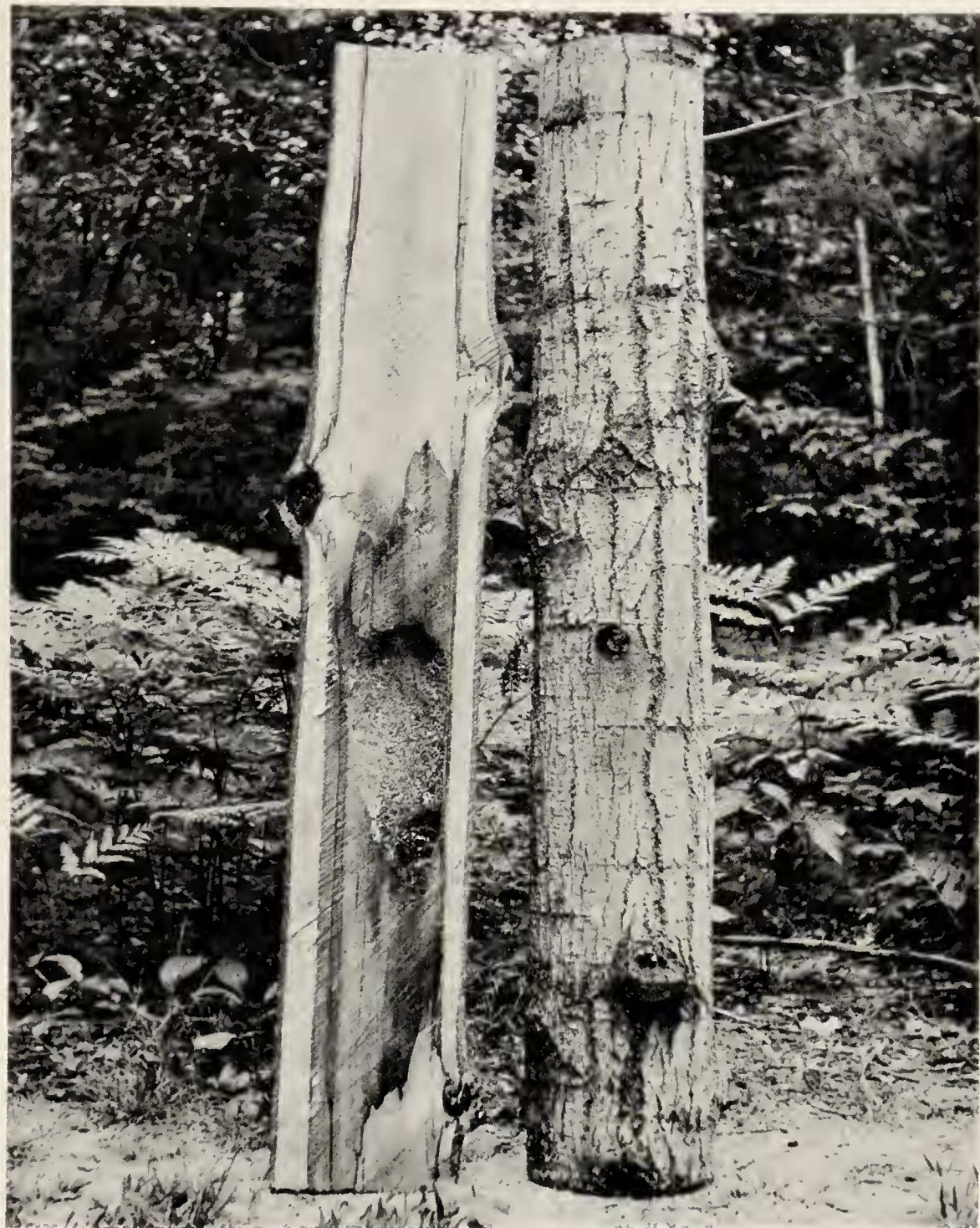
FIG. 2. Longitudinal and front view of the nest of a sapsucker in a mature aspen (age 65 years and 20 cm dbh), in which area of heart rot due to F. igniarius is more limited than in Figure 1.

same territory in successive years by the same letter even though individuals making up the pair might change. Thus, Pair A 1963, for example, was a definite pair, just as Pair A 1969 was another.